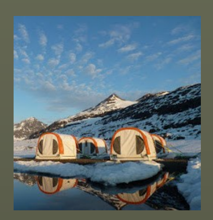
<u>Climate Change and</u> <u>Environmental Processes</u>