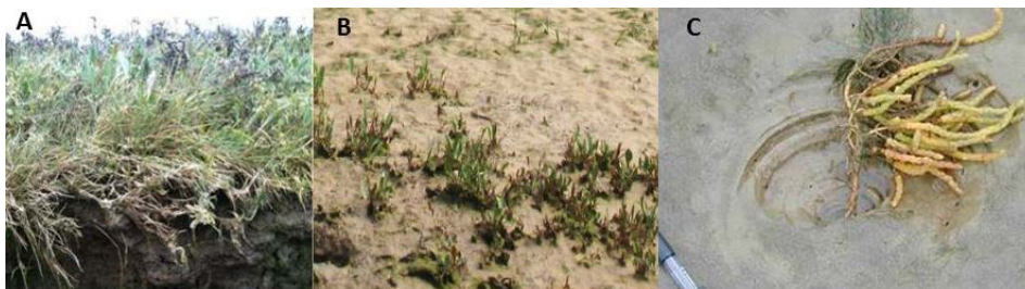
Figure 1: Examples of intertidal vegetation (at low-densities, plants can cause scour patterns around individual stems)

The Student's Task: A large dataset of wave measurements, digital images of soil surfaces around plant arrangements, and sediment samples was collected during the summer of 2018. This yielded high-quality digital images 'before' and 'after' exposure of the soil around various different plant species and arrangements in a large wave flume experiment (see Figure 2) for separate wave conditions of increasing magnitude, as well as data from the field in the UK.